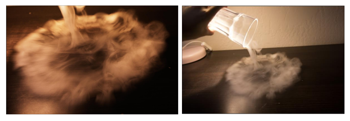
Figure 2: Edited image

The image was processed using Photoshop CS6 software, curve was adjusted to enhance the color and the image was cropped with only smoke left.